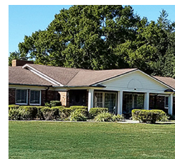
1910 Orient Rd Tampa (813) 630-4673

Specializing in treating all types of substance abuse, including addictions to illicit drugs, alcohol, prescription medications (opiates, sedatives, stimulants), inhalants & gambling, 7 SUMMIT PATHWAYS takes a medically-oriented, evidence-based approach to Substance Abuse and Addiction coupled with natural healing abilities of holistic and experiential therapies. Their comprehensive, personalized method of addiction treatment sets them apart from other Florida recovery centers by providing licensed, experienced caring physicians, therapists, counselors & case managers who work together to develop individualized treatment plans.