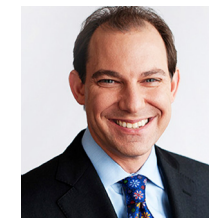
442 W Kennedy Blvd #280, Tampa (813) 350-7890