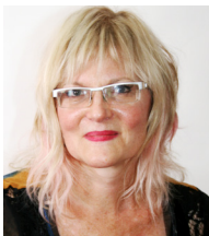
4317 W El Prado Blvd Tampa (813) 832-1115