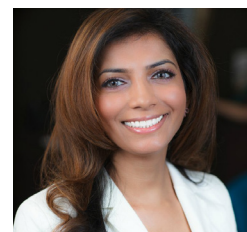
1606 Oakfield Dr Brandon (813) 661-3737

As nature replenishes the earth with elements like sunlight and rain, our bodies and souls must also be replenished. The team at DIVINE DESIGNS SALON & SPA 's 7,000-square-foot elegant day spa works closely with women & men to design a style that is specific to the individual. It is important that the programs fit the client's lifestyle and reflects their personal attitudes towards health and beauty.