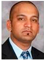
503 E Jackson St #222, Tampa (813) 815-0510