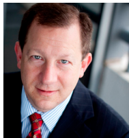
6940 W Linebaugh Ave #101, Tampa (813) 906-6468