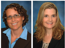
Tampa - Brandon (813) 930-5540