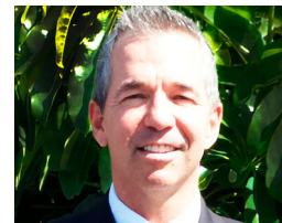
2102 W Cass St #101, Tampa (813) 857-3205