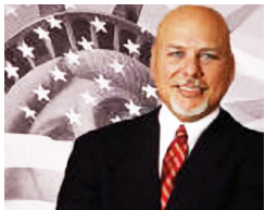
1303 N Armenia Ave Tampa (813) 254-VISA (8472)