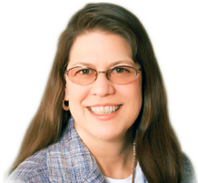
9385 N 56th St #311, Temple Terrace (813) 988-9190