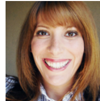
3001 N Rocky Point Drive East #200, Tampa (813) 792-9888 - (813) 389-0214