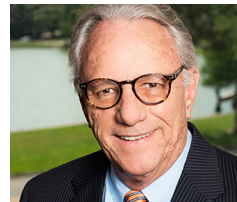
401 E Jackson St, #2700 Tampa - (813) 273-5000 One Lake Morton Dr Lakeland - (813) 284-2200