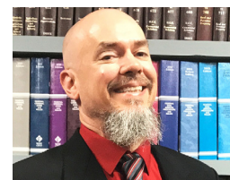
412 E Madison St #1111, Tampa (813) 226-3138