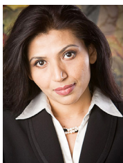
3001 N Rocky Point Dr Orion Ctr, 2nd Fl, Tampa (813) 597-8088