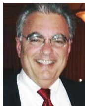
902 N Armenia Ave Tampa (813) 875-9694