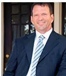
305 S Magnolia Ave Tampa (813) 258-5838