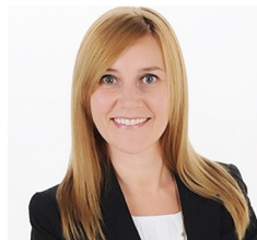
Brandon & Lakeland (888) 402-8472