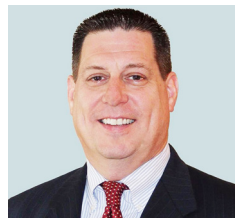
8270 Woodland Center Blvd Tampa (813) 288-0841