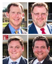
750 W Lumsden Brandon (813) 653-2500