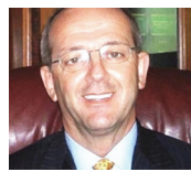
500 Commerce Dr #110, Moon Township (412) 893-2552