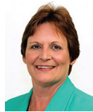
801 Vinial St, #102 Pittsburgh (412) 567-7111

them personally so they can see how their skills could benefit their business partners. The staff at Krown Employment Services prides themselves on being "in tune" with the unique needs of local businesses and employees. Visit: www.krownempvc.com