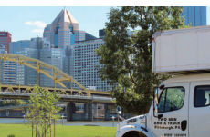
355 Valley Dr, Pittsburgh 1800 Preble Ave, Pittsburgh (412) 357-2690

The Pittsburgh franchise is locally-owned and is operated by lifelong Pittsburghers who understand the ins and outs of America's Most Livable City. Two Men and a Truck is an A+ accredited company with the Better Business Bureau and has a more than 96% customer referral rating. Visit: https://twomenandatruck.com/movers/pa/pittsburgh/southwest