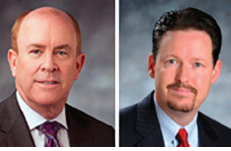
2 Gateway Center, #1750 Pittsburgh (412) 434-5544

Krown Employment Services requires that all applicants meet with them personally so they can see how their skills could benefit their business partners. The staff at Krown Employment Services prides themselves on being "in tune" with the unique needs of local businesses and employees. Visit: www.krownempvc.com