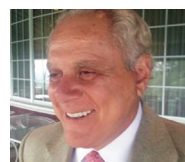
200 James Place Monroeville (412) 373-7125 - Ext 3

Beat insurances deductibles. Be proactive. MED HEALTH SERVICES (MHS) from Pittsburgh offers several sonography medical screenings for only $150.00. This includes: Carotids sonography for arteriosclerosis evaluation; Aorta R/O Aortic Aneurysm; thyroid; urinary bladder & prostate sonography to R/O prostate enlargement and bladder pathologies.