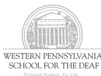
WESTERN PENNSYLVANIA SCHOOL FOR THE DEAF Preparing Students. For Life.