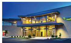
12620 Perry Hwy Wexford (724) 933-4300

Concierge or direct primary care practice refers to a growing movement in U.S. healthcare that enables highly trained and respected physicians to transform the manner in which they deliver medical care to their patients. CONNECTEDHEALTH is a proactive, preventive & patient-centered primary practice that surrounds you with a team of people focused on your well-being.