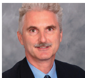
7051 Steubenville Pk #7, Oakdale (412) 788-2000