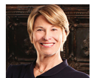
McKees Rocks Sewickley (412) 310-3555